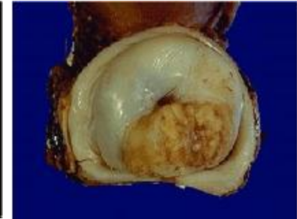
Cervix with severe disease (patient may have no symptoms)